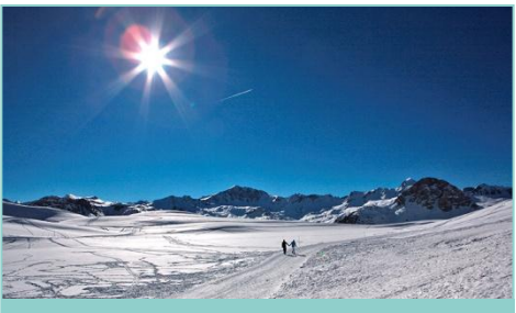
More to Discover