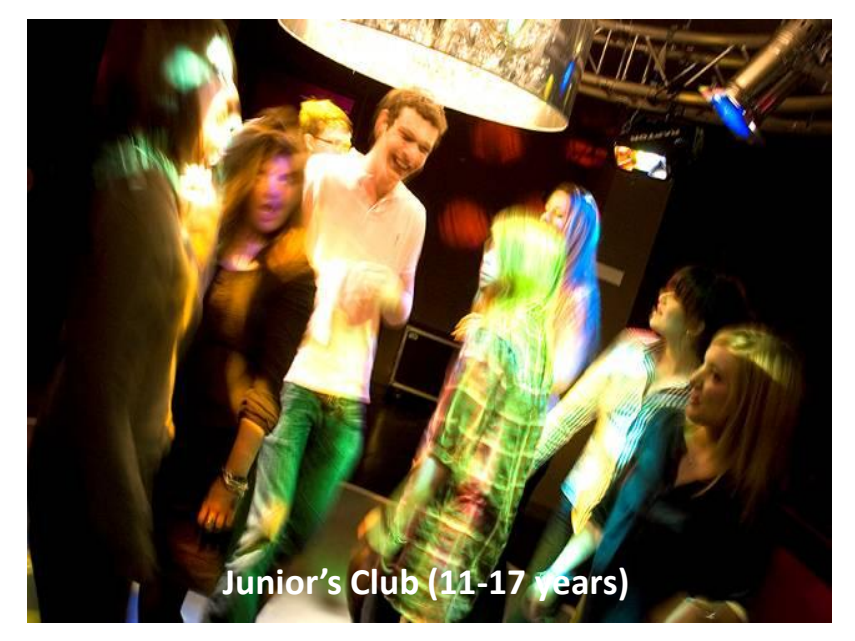
Supervised in two separate age group. Everything is available, nothing is imposed. Freedom with exclusivity, they will just love the mood.