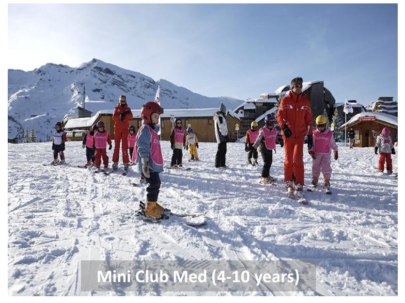
All activities to satisfy their endless thirst of discovery.