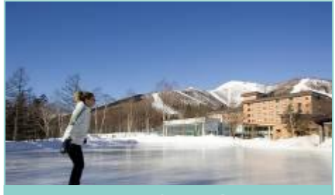
More Locations & Space