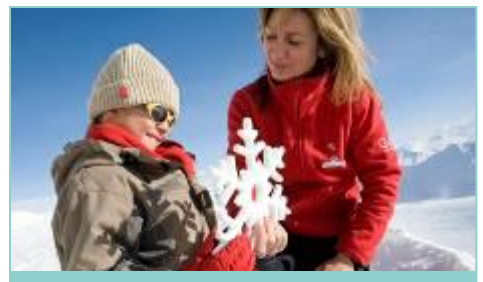
More for Kids and Teens