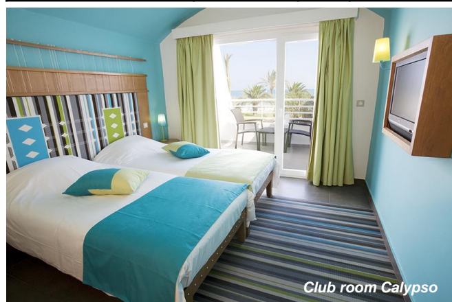
Club room Calypso