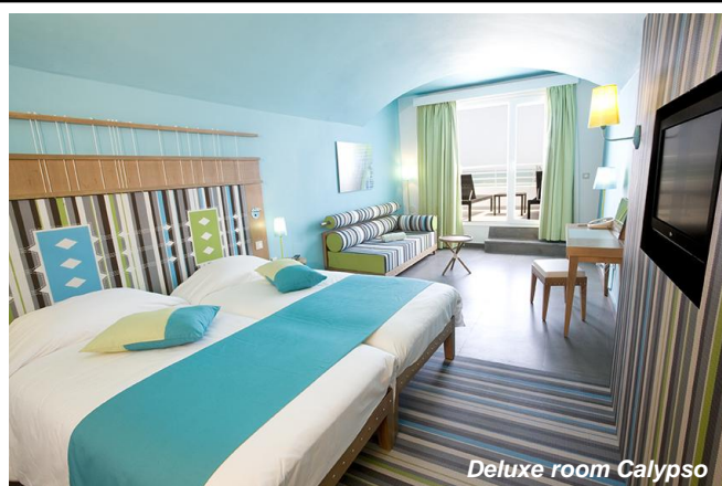
Deluxe room Calypso