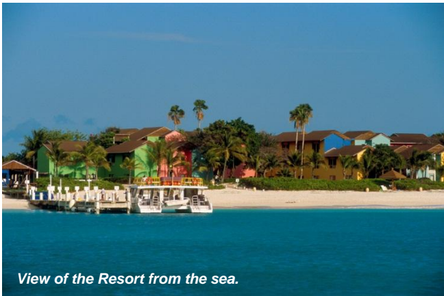
View of the Resort from the sea.

This large bar with its bright, warm colours, is located near the Reception, the main restaurant and the theatre. With its open-air dance floor, discover Club Med evening entertainment.