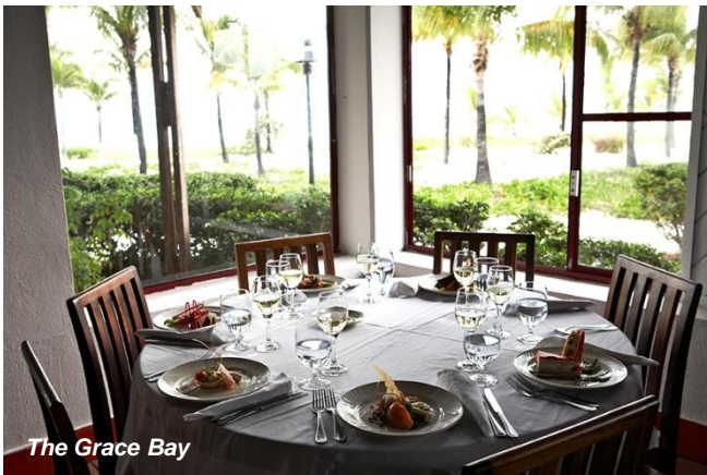
The Grace Bay